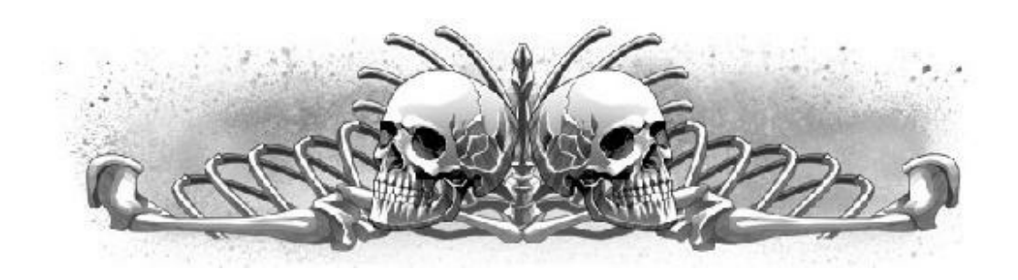
A memory from the not so distant past...