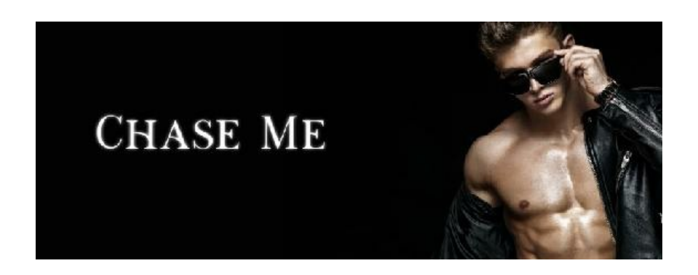
Read Fallon's story that takes place before Issy finds her voice in Claim Me... READ NOW in KU!