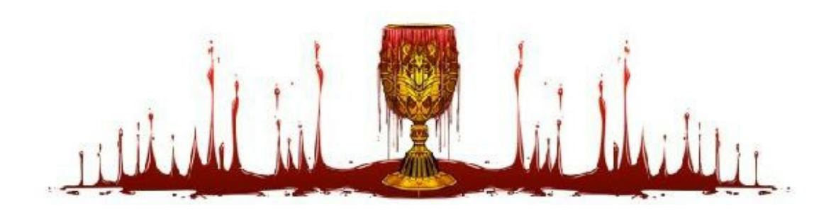
A few minutes earlier...

I 'm familiar with death, but I've never quite experienced it so up close and personal.