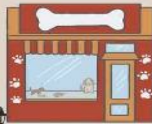
Little Friends Dog Rescue