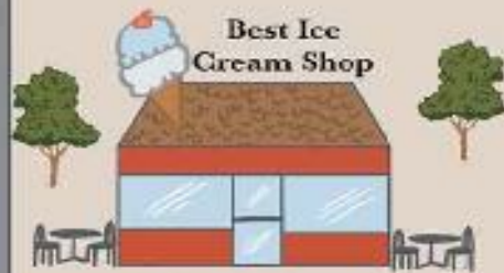
Best Ice Cream Shop