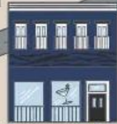
The Spotted Zebra