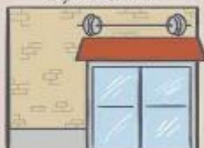
Gym For All