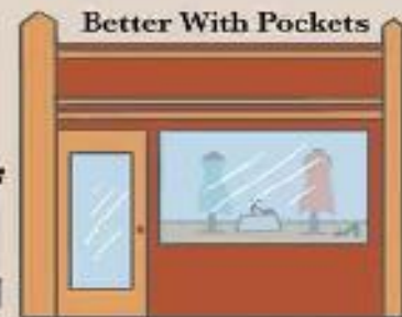
Better With Pockets