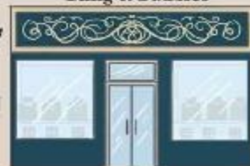
Bling & Baubles