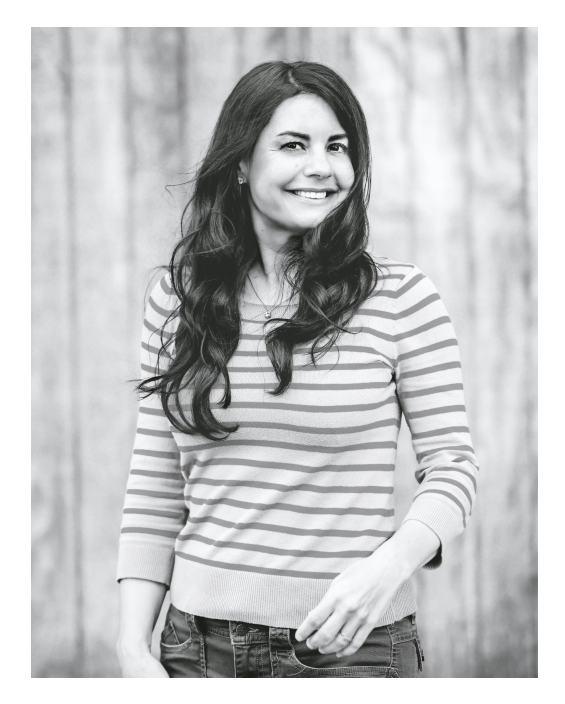
Photograph of the author