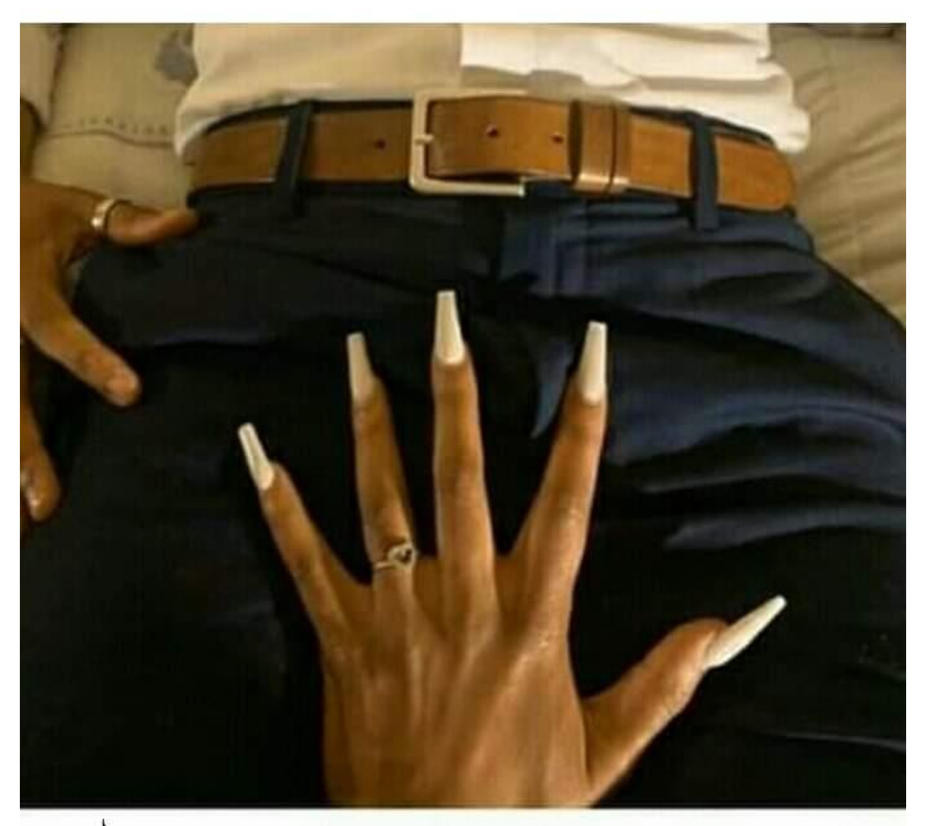
Don't hate the game, hate the player...