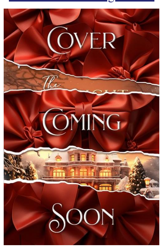
Pre Order The Albright Hotel