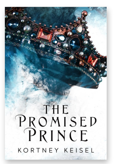
He's promised to another.