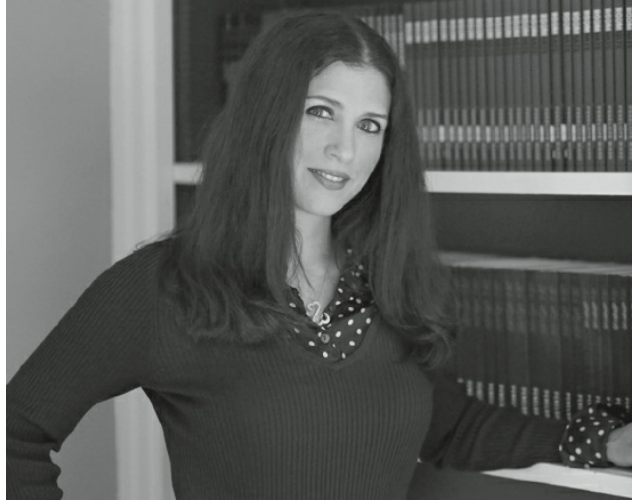
Penelope Ward

Penelope Ward is a New York Times , USA Today , and #1 Wall Street Journal bestselling author. She grew up in Boston with five older brothers and spent most of her twenties as a television news anchor. Penelope resides in Rhode Island with her husband, son, and beautiful daughter, who has autism. She is the author of more than twenty novels, including Stepbrother Dearest , Neighbor Dearest , Drunk Dial , and the #1 Wall Street Journal bestseller RoomHate .