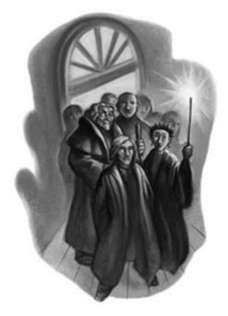
THE ADVANCE GUARD

I 've just been attacked by dementors and I might be expelled from Hogwarts. I want to know what's going on and when I'm going to get out of here.