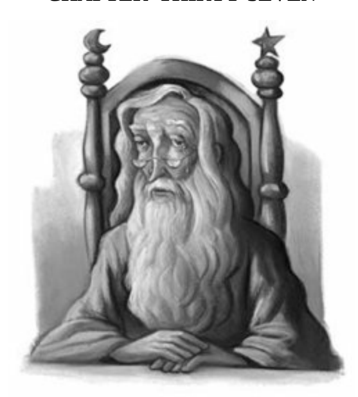
THE LOST PROPHECY

arry's feet hit solid ground again; his knees buckled a little and the golden wizard's head fell with a resounding clunk to the floor. He looked around and saw that he had arrived in Dumbledore's office.