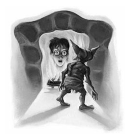
OUT OF THE FIRE

I 'm not going. . . . I don't need the hospital wing. . . . I don't want . . ." He was gibbering, trying to pull away from Professor Tofty, who was looking at him with much concern, and who had just helped Harry out into the entrance hall while the students all around them stared.