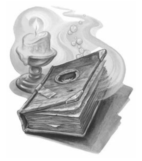
BY J.K. ROWLING