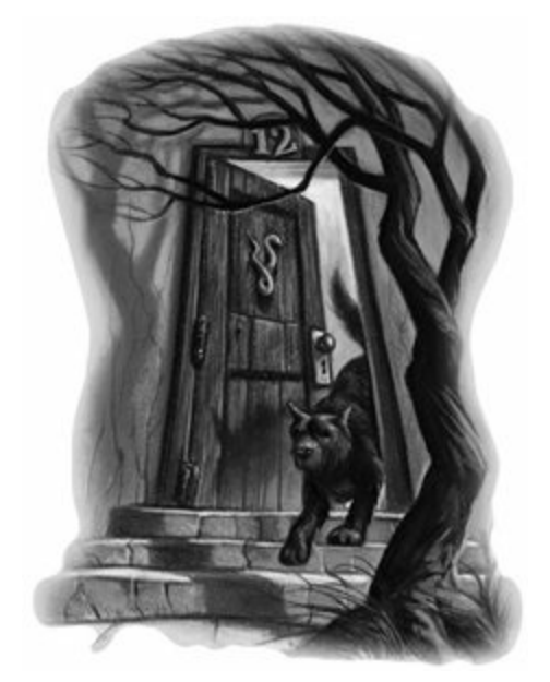
BY J.K. ROWLING