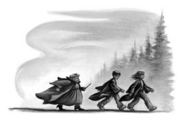
FIGHT AND FLIGHT

arry had no idea what Hermione was planning, or even whether she had a plan. He walked half a pace behind her as they headed down the corridor outside Umbridge's office, knowing it would look very suspicious if he appeared not to know where they were going. He did not dare attempt to talk to her; Umbridge was walking so closely behind them that he could hear her ragged breathing.