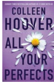
All Your Perfects