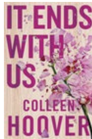
It Ends With Us