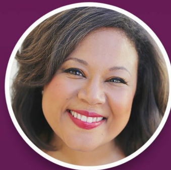
New York Times best-selling author JASMINE GUILLORY

AVAILABLE WHEREVER BOOKS, EBOOKS, AND AUDIOBOOKS ARE SOLD