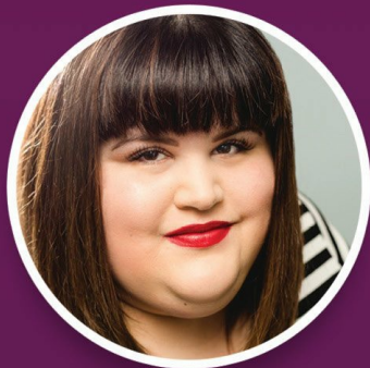
#1 New York Times best-selling author JULIE MURPHY