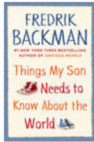
Things My Son Needs to...