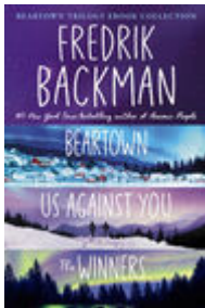
The Beartown Trilogy...