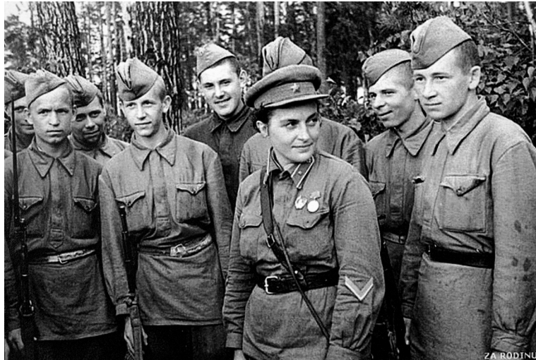
Sniper platoon commander Lyudmila Pavlichenko with her troops (32nd Guards Parachute Division), Moscow military district, August 1942