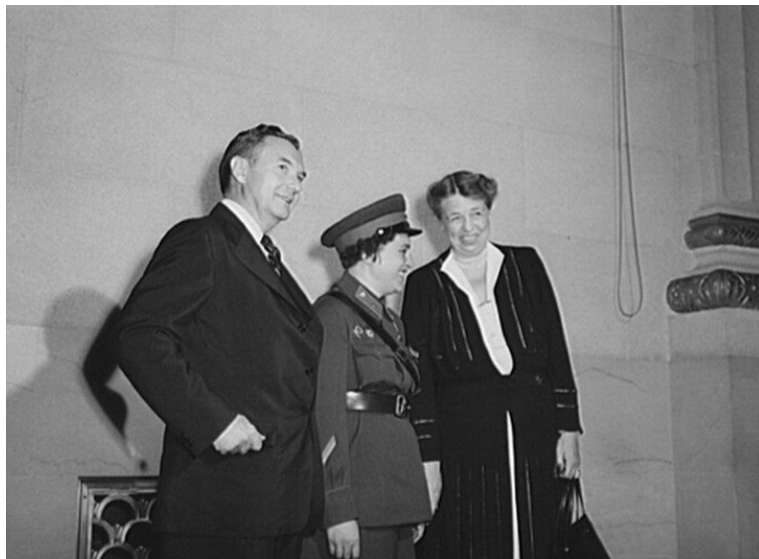
Lyudmila Pavlichenko and Eleanor Roosevelt, USA tour, 1942