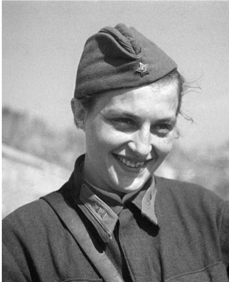
Lyudmila Mikhailovna Pavlichenko