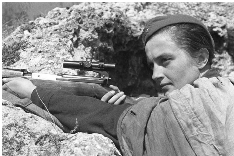
Lyudmila Pavlichenko, propaganda photograph, Sevastopol, early 1942