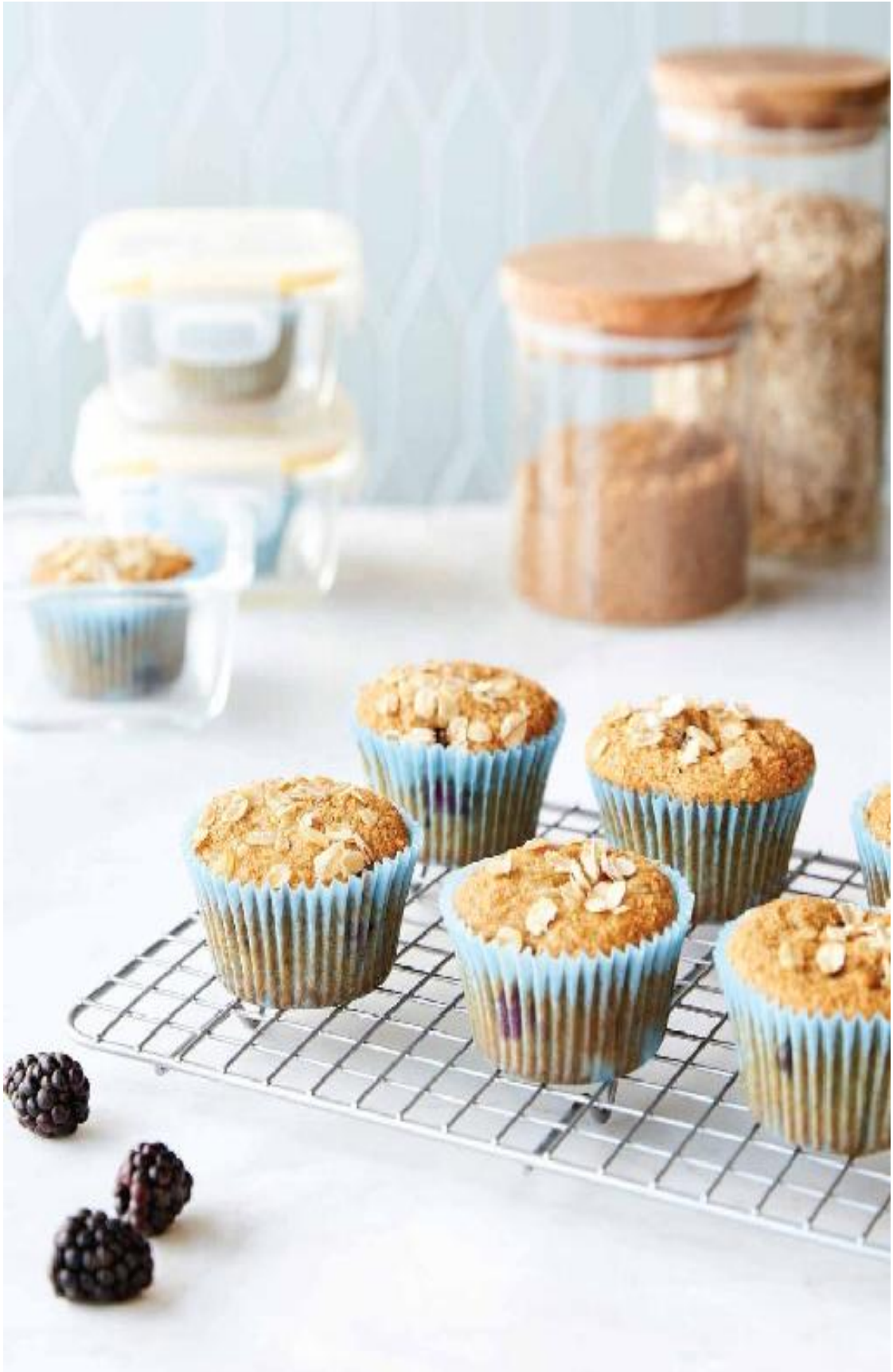
Blackberry Bran Muffins