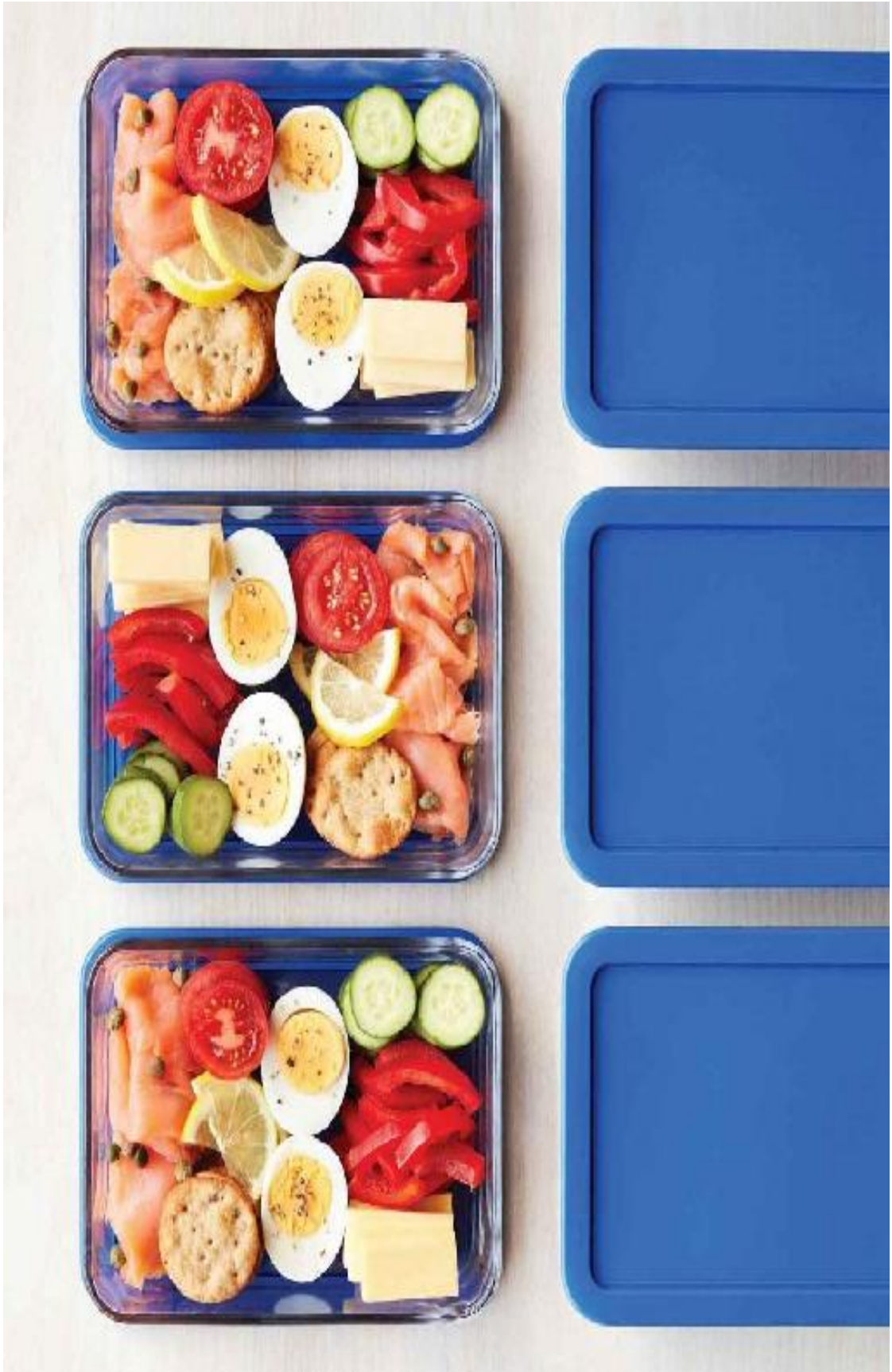
Smoked Salmon Breakfast Bowl