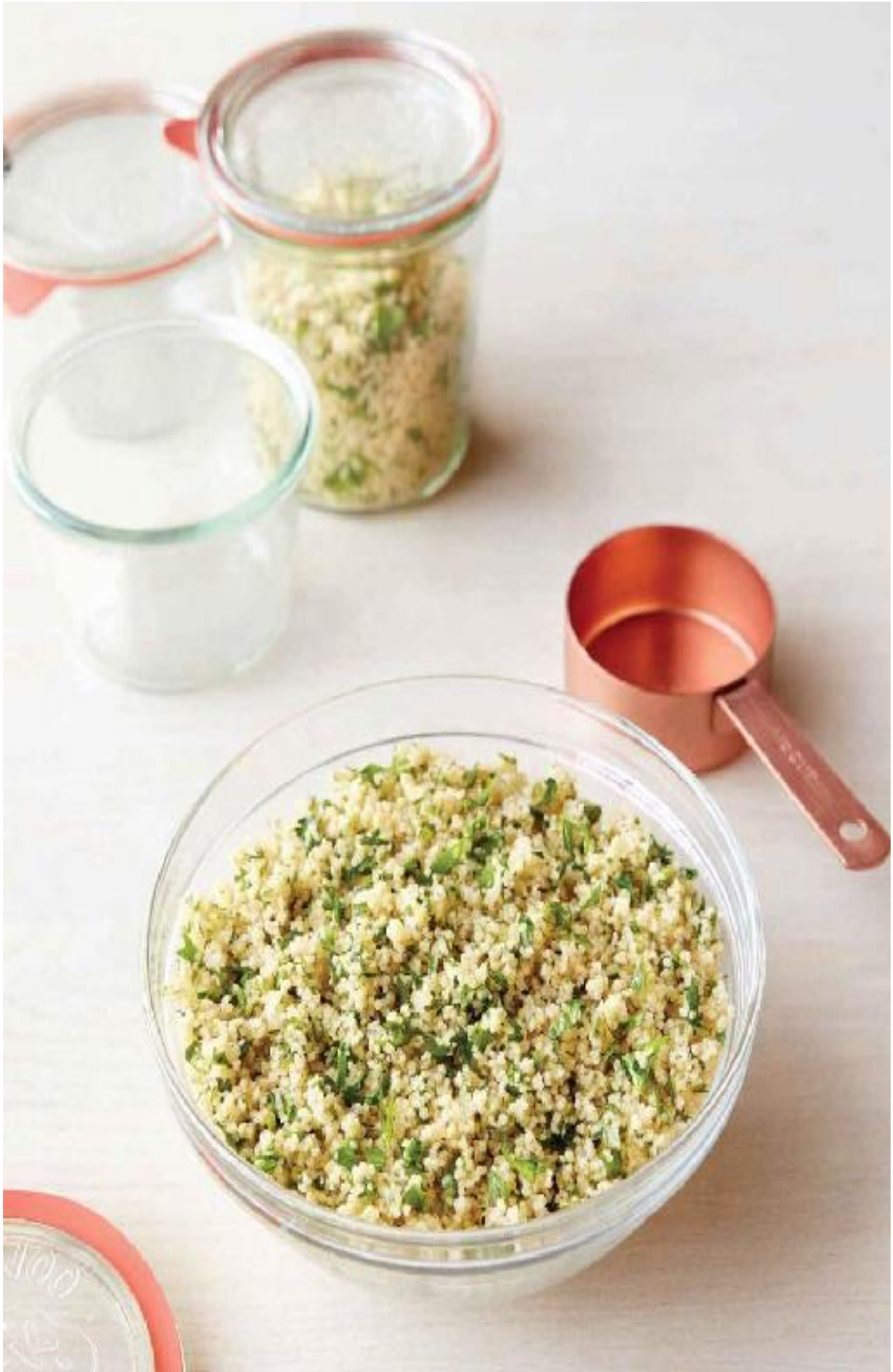
Parsleyed Whole-Wheat Couscous