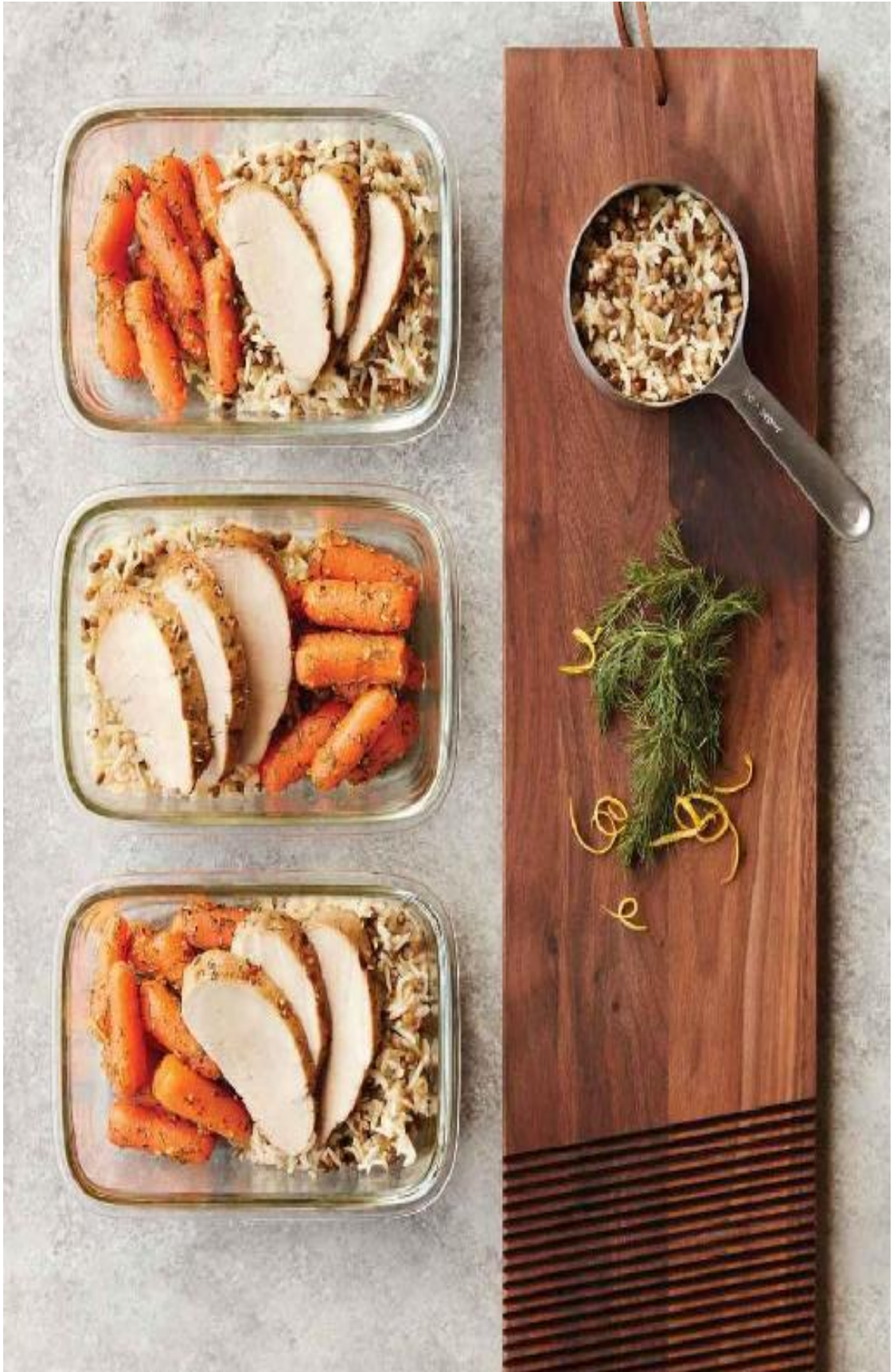
Rosemary-Honey Mustard Pork Tenderloin with Lemon-Dill Carrots