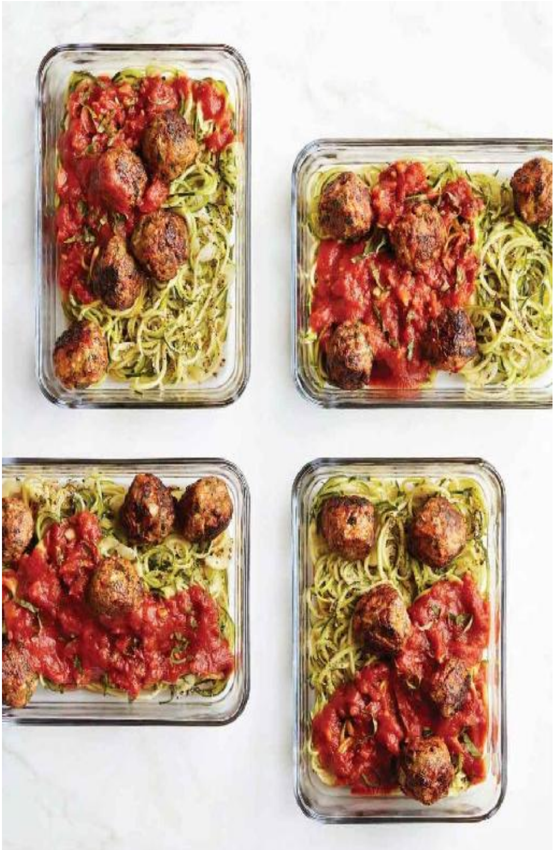
Turkey Meatballs with Carrots over Zucchini Noodles