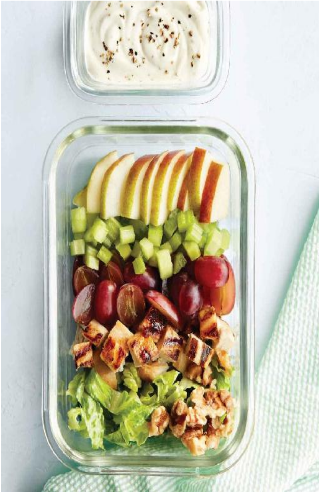
Lighter Waldorf Salad with Pears