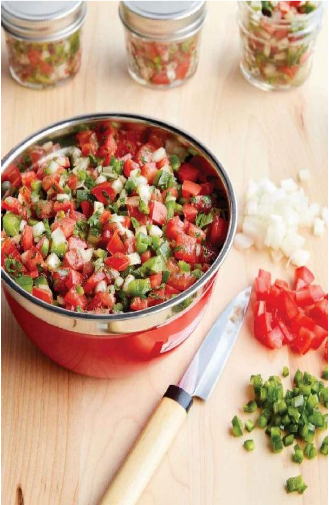
Meal Prep Salsa