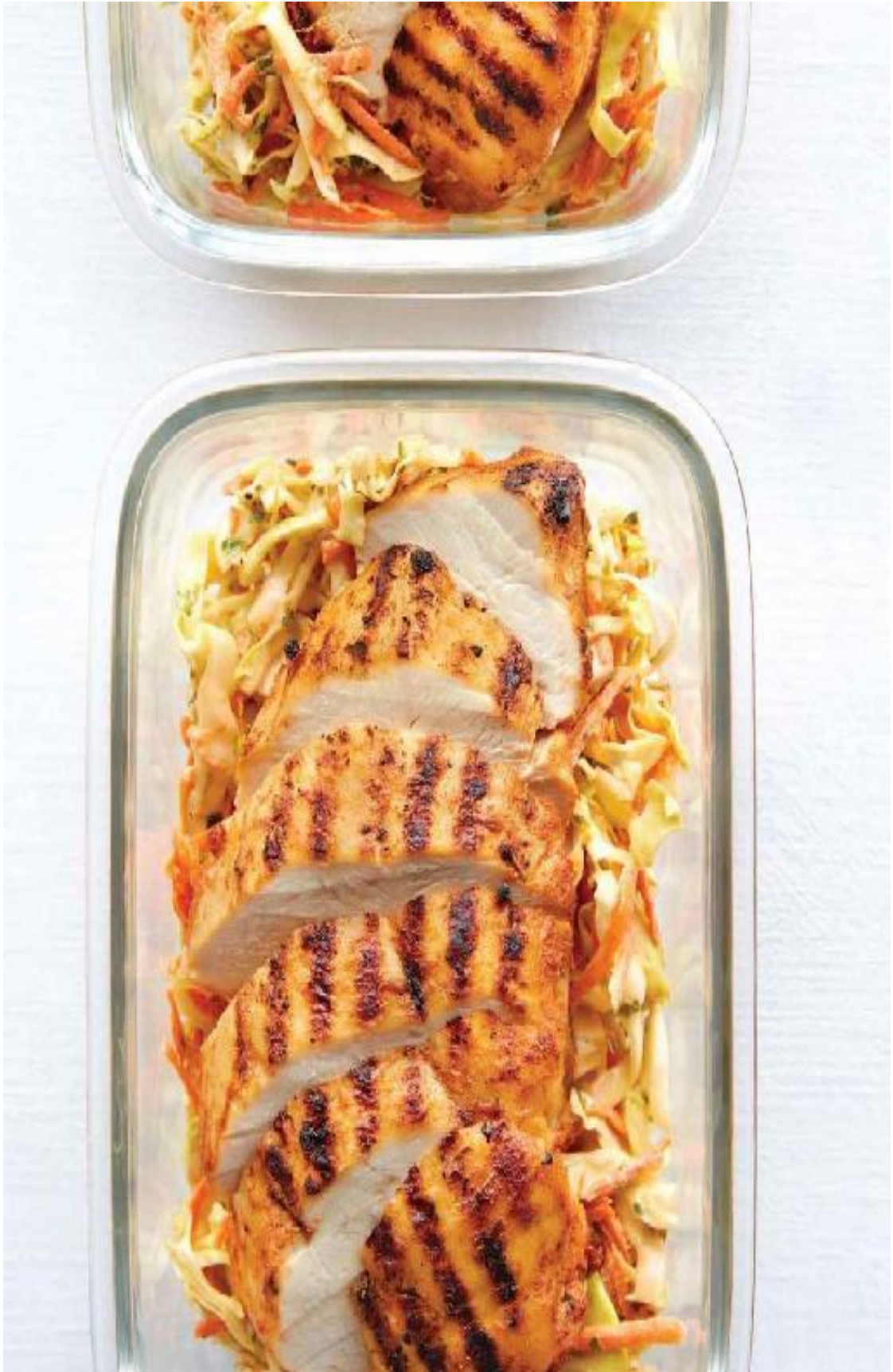
Grilled Chicken with Carrot-Cabbage Slaw