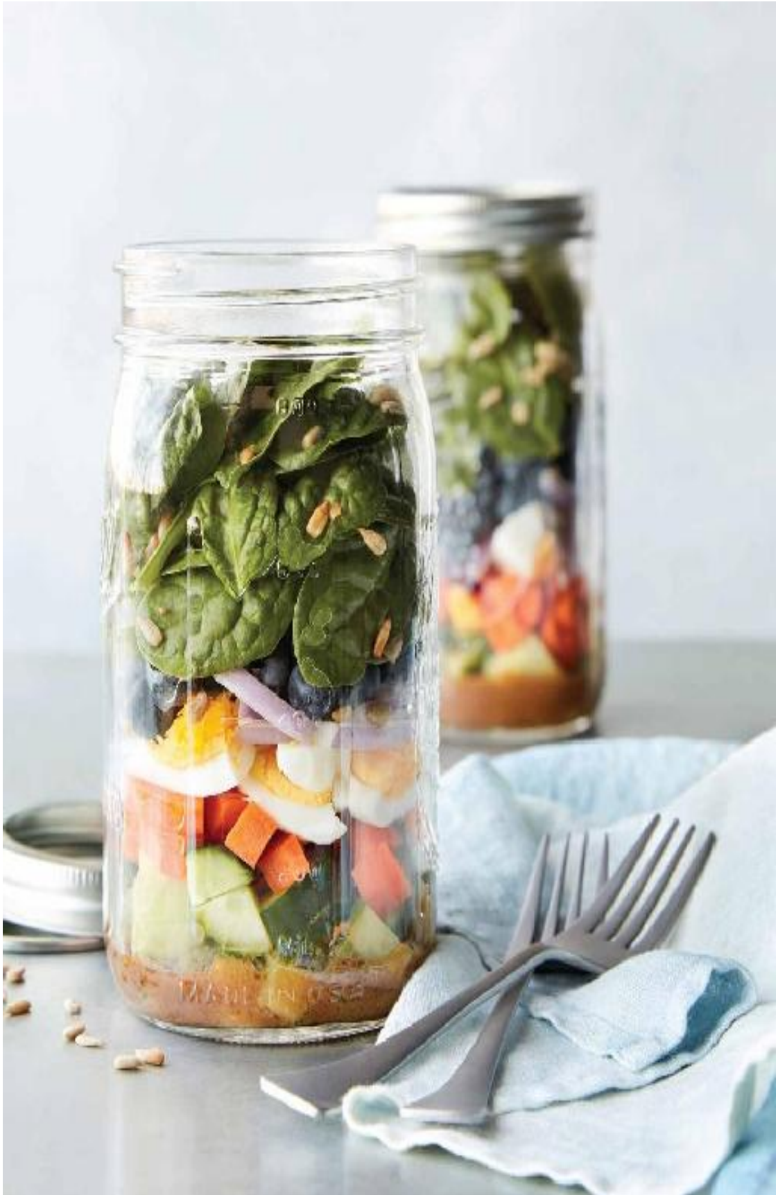
Superfood Salad with Lemon-Balsamic Vinaigrette