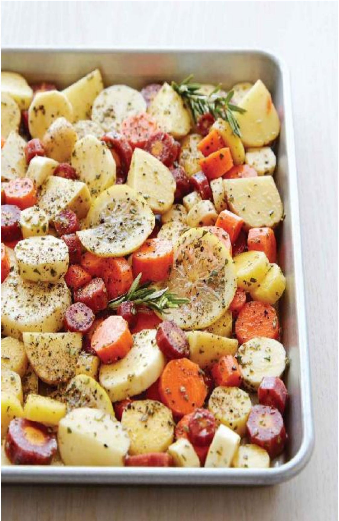
Sheet Pan Lemon Chicken with Potatoes and Carrots