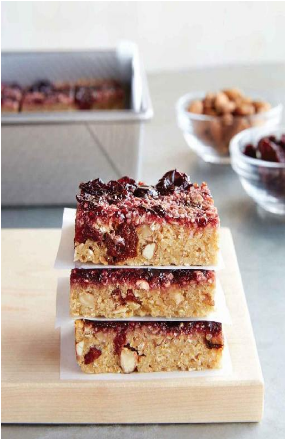
Baked Almond Cherry Bars