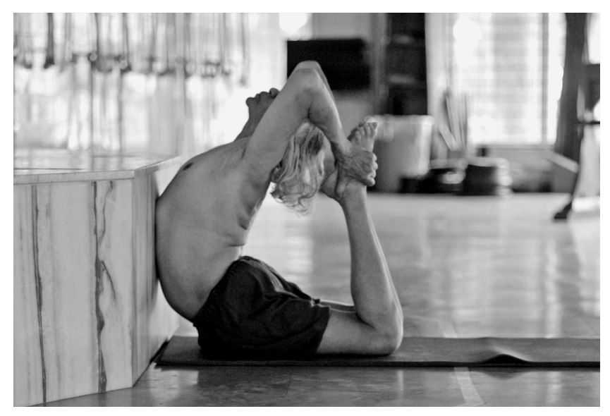
FIGURE 3.1 B. K. S. Iyengar practicing kapota asana or "pigeon posture" at the age of 91.

the above-listed key figures, postural yoga became something that was increasingly prescribed and consumed as a product independent of ethnic, philosophical, or religious identities or commitments. Postural yoga was instead a product that could be chosen as a body-enhancing practice that was one part of individual regimens of self-development, and it was being packaged in this way for transnational audiences.