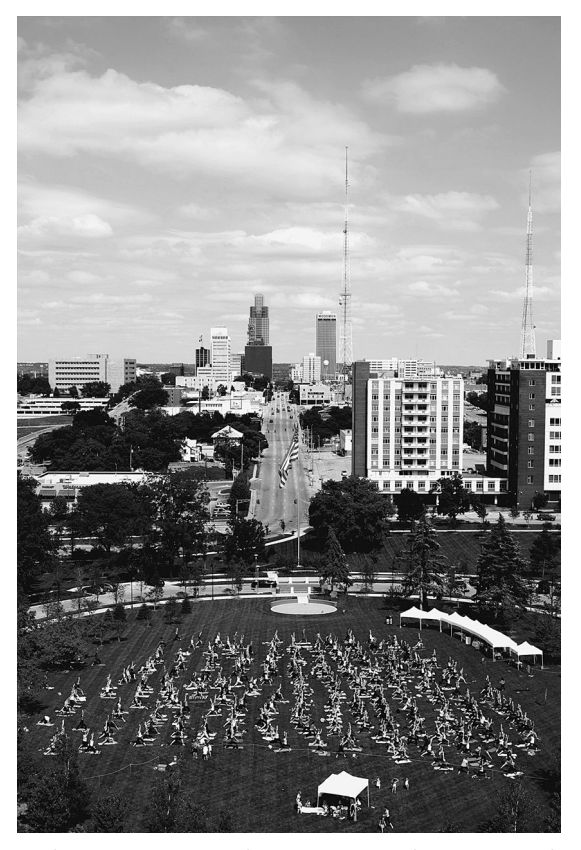
FIGURE 4.1 People practice postural yoga en masse during special events around the world each year. For example, practitioners gather annually in twenty cities across the United States to celebrate Yoga Rocks the Park, described as "a locally staffed celebration of community for the whole family promoting peace, giving and wellbeing on a local and global scale" (Yoga Rocks the Park 2014). In this image, hundreds pose together in the virabhadra asana (warrior posture) in 2011 at the Yoga Rocks the Park event in Omaha, Nebraska. Photographed by Daniel Muller. (Courtesy of Esoteric Velvet , from a story by Meghann Schense, esoteric velvet.com.)

products, such as yoga pants, that are immediately available in local shopping malls or through online retail sites. More generally, consumers have "substantial and unpredictable decision-making power in the selection and use of cultural commodities" (Willis 1990: 137). Entrepreneurs and organizations, in turn, construct brands that they think consumers will buy. Consumers, however, are not the only agents. Rather, the construction of brands is based on a dialectical exchange between the entrepreneurs who produce desires and needs for goods and services and consumers