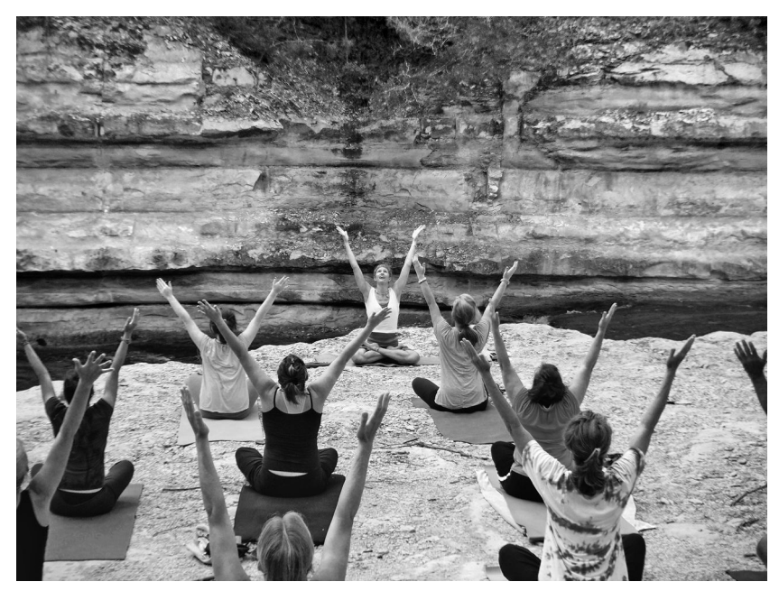
FIGURE 6.1 Yoga 4 Love Community Outdoor Yoga class for Freedom and Gratitude on Independence Day 2010 in Dallas, Texas.

"Best Yoga" alongside "Best Burger," "Best Brunch," and "Best Hair Salon" in its famous "The Best of Big D" series ( D Magazine 2011).