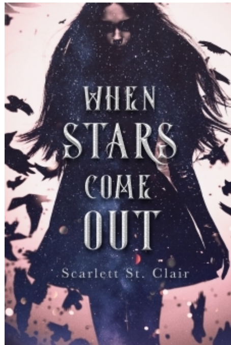
When Stars Come Out