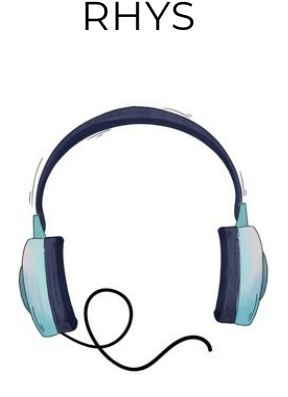
Three Years Later

If I thought the press would be worse with me officially in the NHL alone , it doesn't compare in the slightest to when my father and I are in the same vicinity.