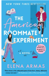
The American Roommate Experiment