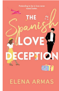
The Spanish Love Deception