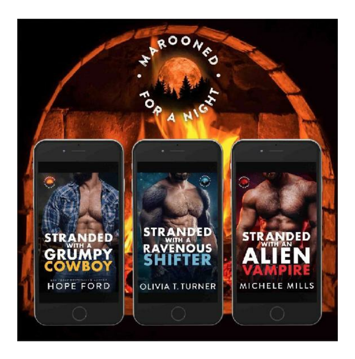
Stranded With A Grumpy Cowboy By Hope Ford