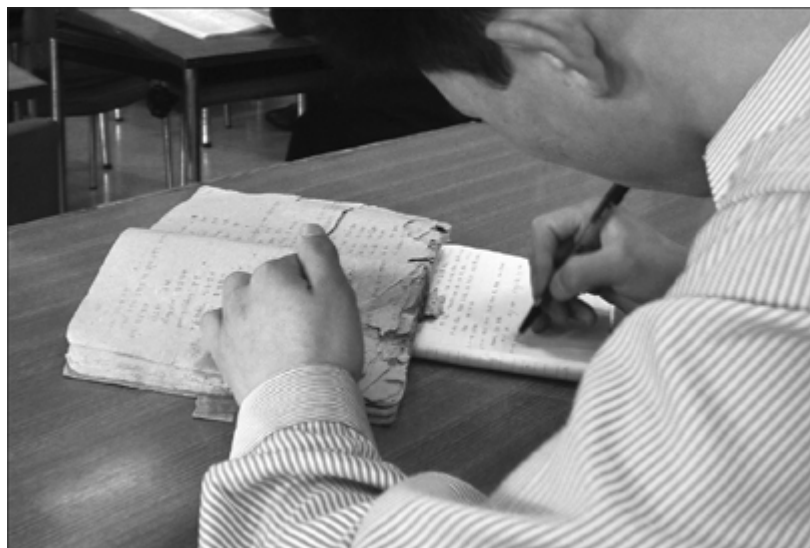
A student in the Grand People's Study House in Pyongyang, the largest library in North Korea.