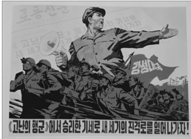
Propaganda poster for the Arduous March.

I T HAS BEEN SAID THAT PEOPLE REARED IN COMMUNIST COUNTRIES cannot fend for themselves because they expect the government to take care of them. This was not true of many of the victims of the North Korean famine. People did not go passively to their deaths. When the public distribution system was cut off, they were forced to tap their deepest wells of creativity to feed themselves. They devised traps out of buckets and string to catch small animals in the field, draped nets over their balconies to snare sparrows. They educated themselves in the nutritive properties of plants. They reached back into their collective memory of famines past and recalled the survival tricks of their forefathers. They stripped the sweet inner bark of pine trees to grind into a fine powder that could be used in place of flour. They pounded acorns into a gelatinous paste that could be molded into cubes that practically melted in your mouth.