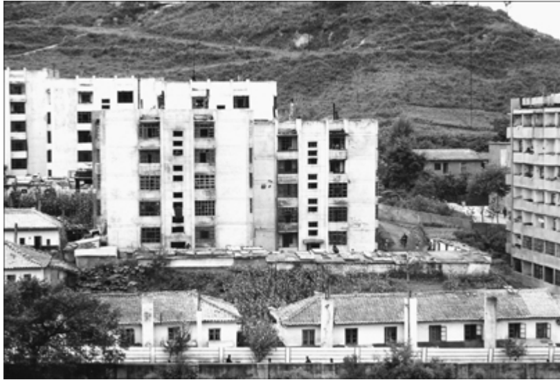
Apartment blocks in Chongjin.