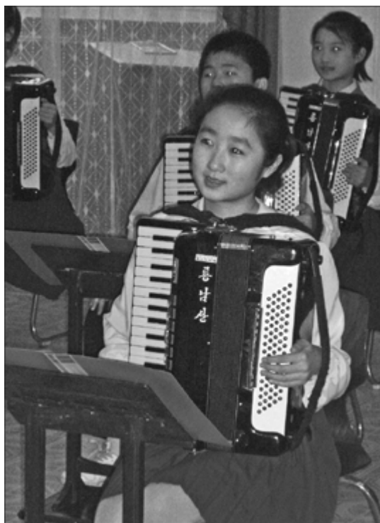
Accordion lessons in Pyongyang, 2005.