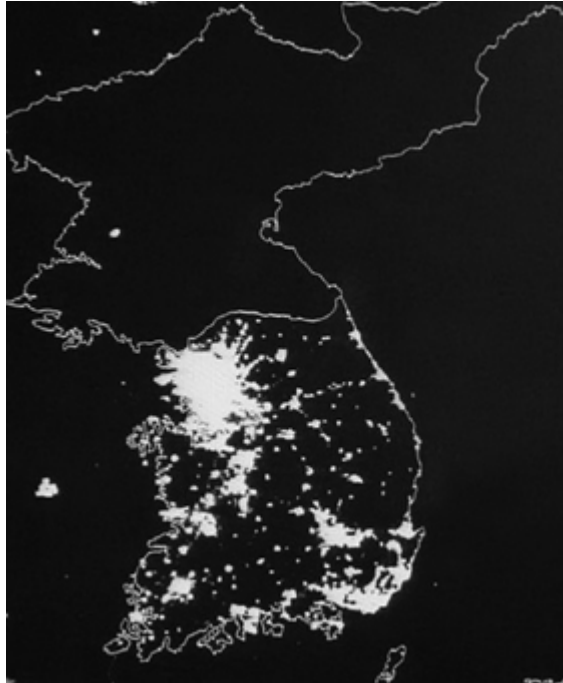
Satellite photo of North and South Korea by night.

I F YOU LOOK AT SATELLITE PHOTOGRAPHS OF THE FAR EAST by night, you'll see a large splotch curiously lacking in light. This area of darkness is the Democratic People's Republic of Korea.