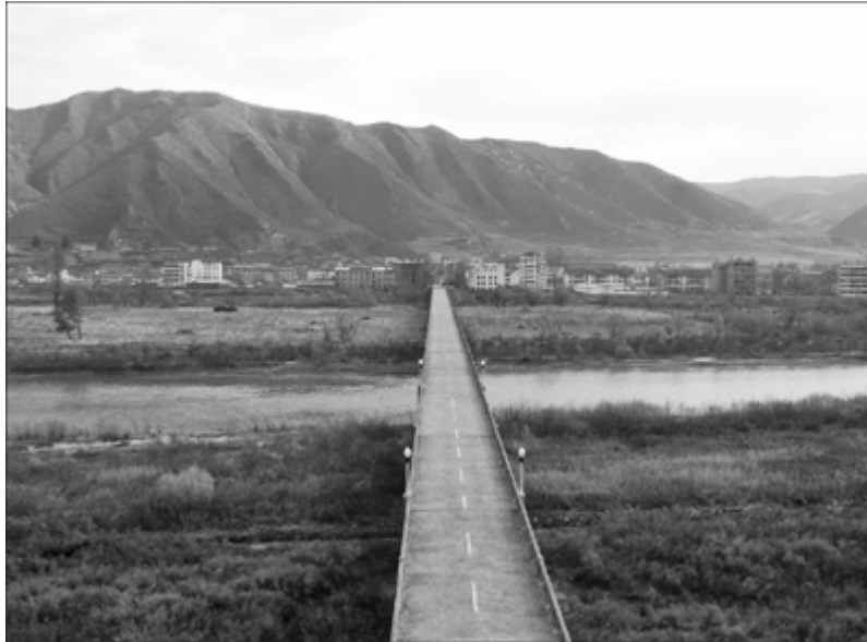
The Tumen River as seen from China.

T HE LESS THEY COULD CONFIDE IN EACH OTHER, THE MORE strained their relationship was.