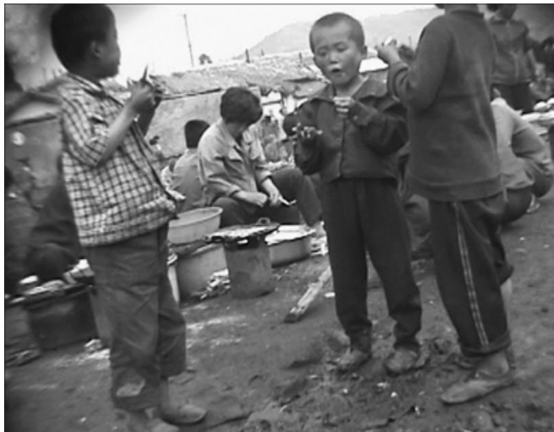
Boys at a North Korean market.