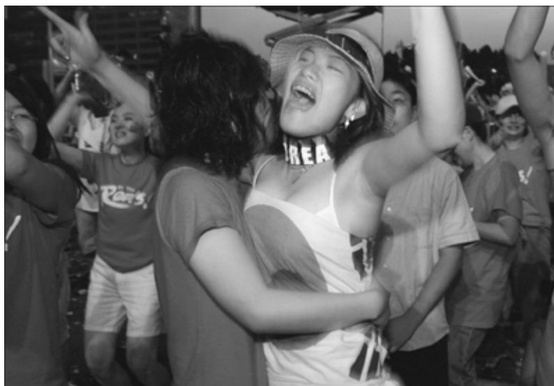
World Cup celebration, Seoul, 2002.