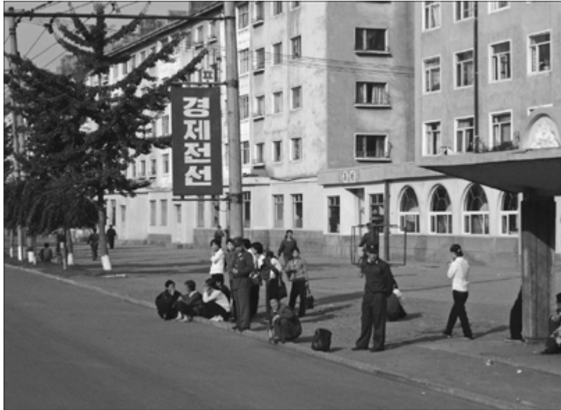
A bus stop on Chongjin's main street, 2008.

D URING THE FIVE YEARS THAT I SPENT IN SEOUL REPORTING for the Los Angeles Times , I attended numerous dinners with fellow journalists, diplomats, and academics. Invariably the conversation would turn to North Korea, with the participants speculating about when Kim Jong-il's regime might collapse.