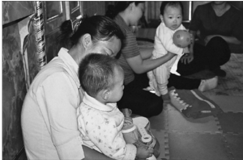
North Korean wives of Chinese men, Tumen, 2003.