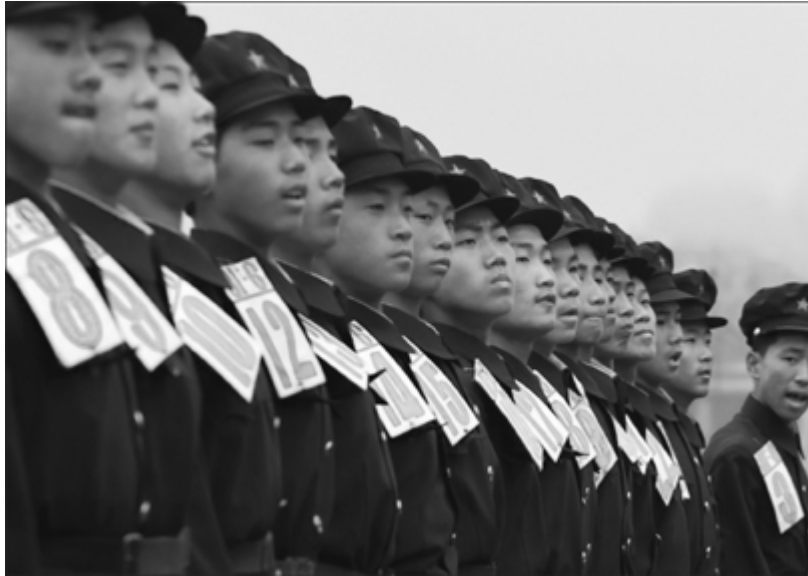
North Korean guards stand at attention in Pyongyang.

N ORTH KOREANS HAVE MULTIPLE WORDS FOR PRISON IN MUCH the same way the Inuit do for snow. Somebody who commits a minor offense—such as skipping work—might be sent to a jibkyulso , a detention center operated by the People’s Safety Agency, a low-level police unit, or maybe a rodong danryeondae , a labor camp, where the offender would be sentenced to a month or two of hard labor, such as paving a road.