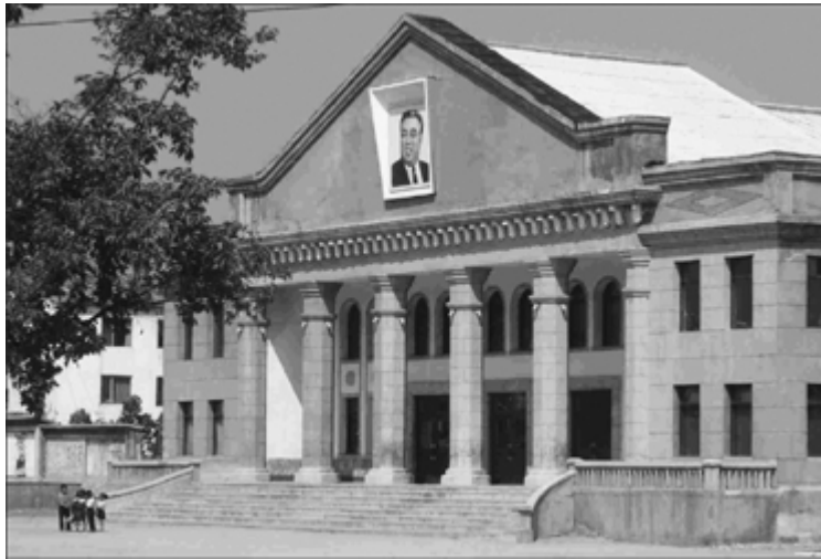
Kyongsong County Culture Hall.