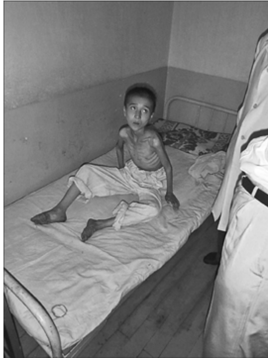
Boy in Hamhung hospital.