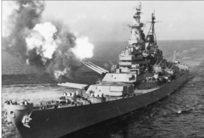
The USS Missouri firing on Chongjin, October 1950.

C HONGJIN IS A CITY WITH A BAD REPUTATION, AN UNDESIRABLE place to live even by North Korean standards. The city of 500,000 is wedged between a granite spine of mountains zigzagging up and down the coast and the Sea of Japan, which Koreans call the East Sea. The coastline has the rugged beauty of Maine, and its glistening waters run deep and cold, but fishing is treacherous without a sturdy boat. The wind-whipped mountains support few crops, and temperatures in the winter can plunge to 40 degrees below (Fahrenheit). Only the land around the low-lying coast can grow rice, the staple food around which Korean culture revolves. Historically, Koreans have measured their success in life by their proximity to power—part of a long Asian tradition of striving to get off the farm and close to the imperial palace. Chongjin is practically off the map of Korea, so far north that it is nearer to the Russian city of Vladivostok than to Pyongyang. Even today, the drive between Chongjin and Pyongyang, just 250 miles apart, can take three days