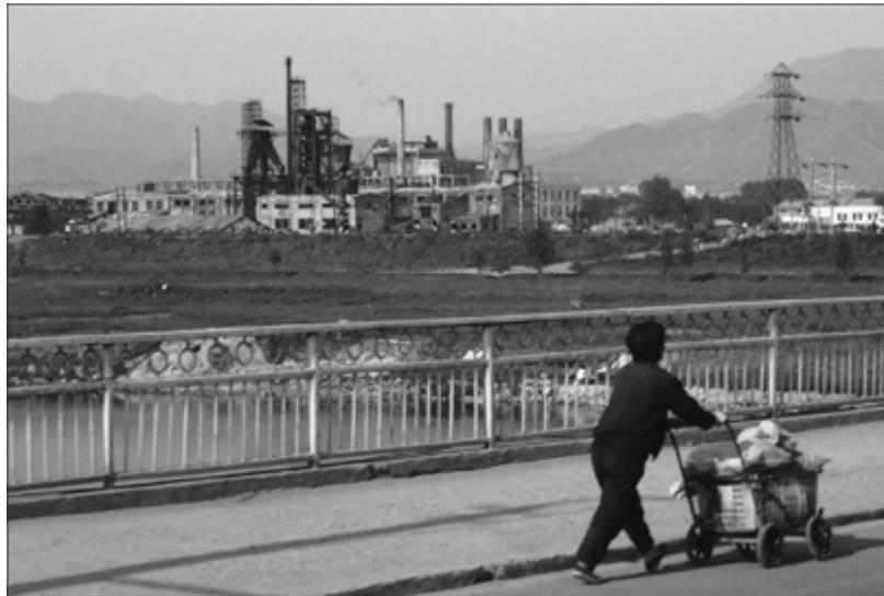
The industrial district of Chongjin.

AS THE YEAR 1990 OPENED, THE BERLIN WALL HAD BEEN reduced to chunks of rubble hawked by souvenir vendors in a soon-to-be-reunited Germany. The Soviet Union was being wrenched apart at the seams. Mao Zedong's face was an iconic image on kitschy watches that American tourists bought in Beijing. The former Communist dictator of Romania, Nicolae Ceausescu, not coincidentally a close personal friend of Kim Il-sung's, had recently been executed by a firing squad. Statues of Lenin were being pulled off their pedestals and smashed to pieces. Communist Party cadres around the world were gobbling up Big Macs for lunch and washing them down with Coca-Cola. In the hermit kingdom of North Korea, however, life carried on as it always had.