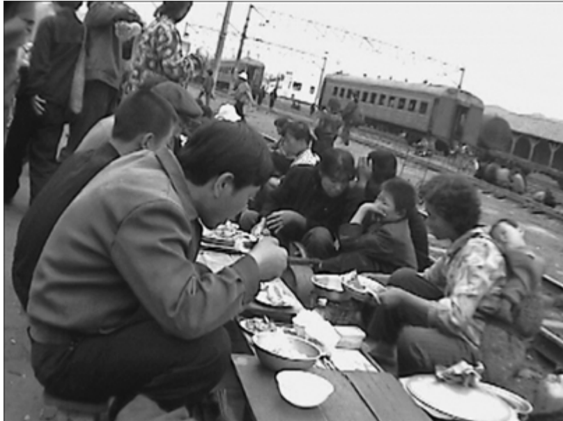
A makeshift restaurant in Chongjin.