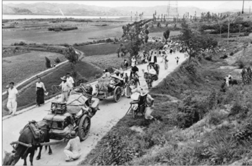
Refugees from the Korean War on the move.