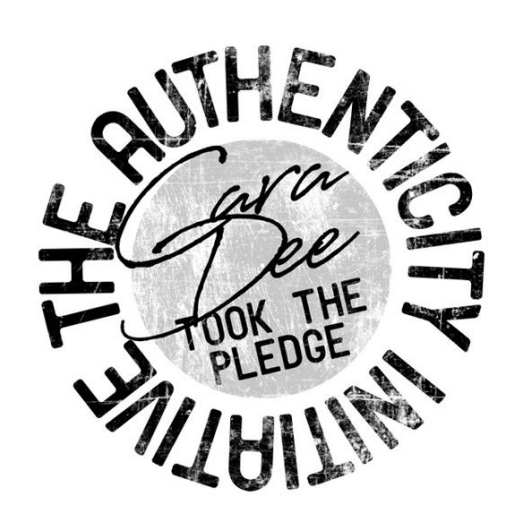
Authors against using generative AI

Copyright © 2023 by Cara Dee All rights reserved