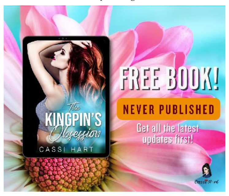
The Kingpin's Obsession